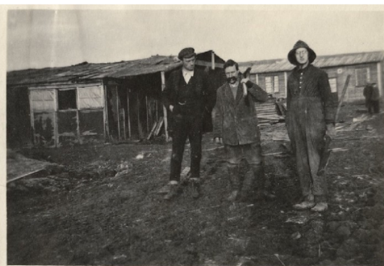
Photo 9: Pierre Ceresole and other volunteers in front the huts in Esnes, 1920/1921